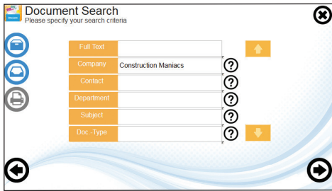
Searchable fields allow for fast indexing